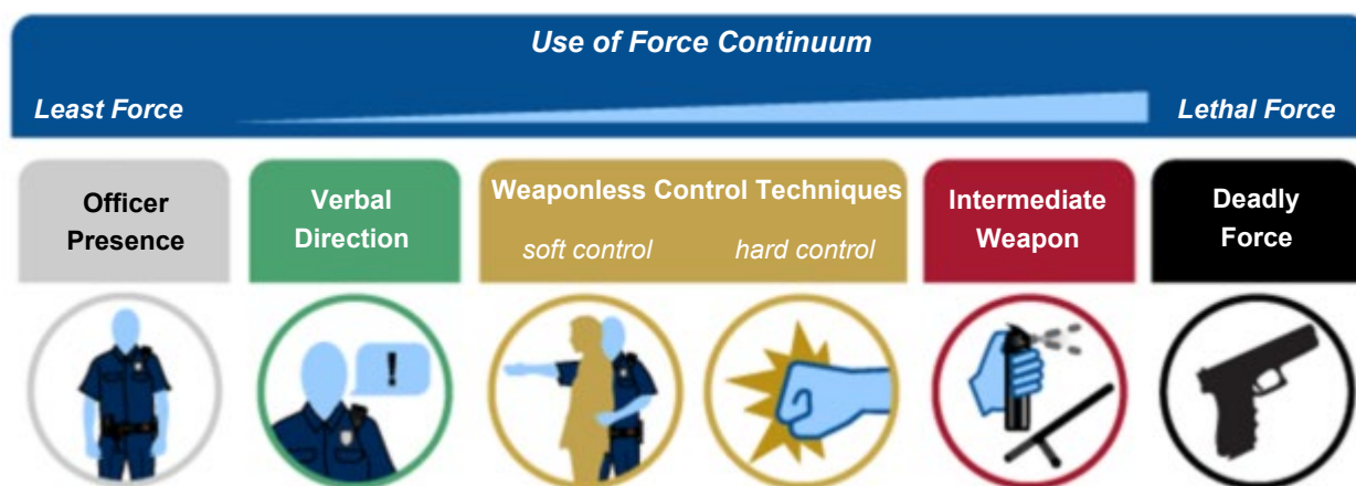
Figure 4 – LWPD Use of Force Continuum

There were 28 shows of force in 2022, with the most common being the pointing of a firearm (21). Others included the pointing of an electronic control device (Taser) (6) and the display of a police K-9 (2). Shows of force are reviewed in the exact same manner as uses of force, and the reasonableness is evaluated for compliance with law and department policy. In all instances where force was shown in 2022, all were found to be in compliance with department policy.