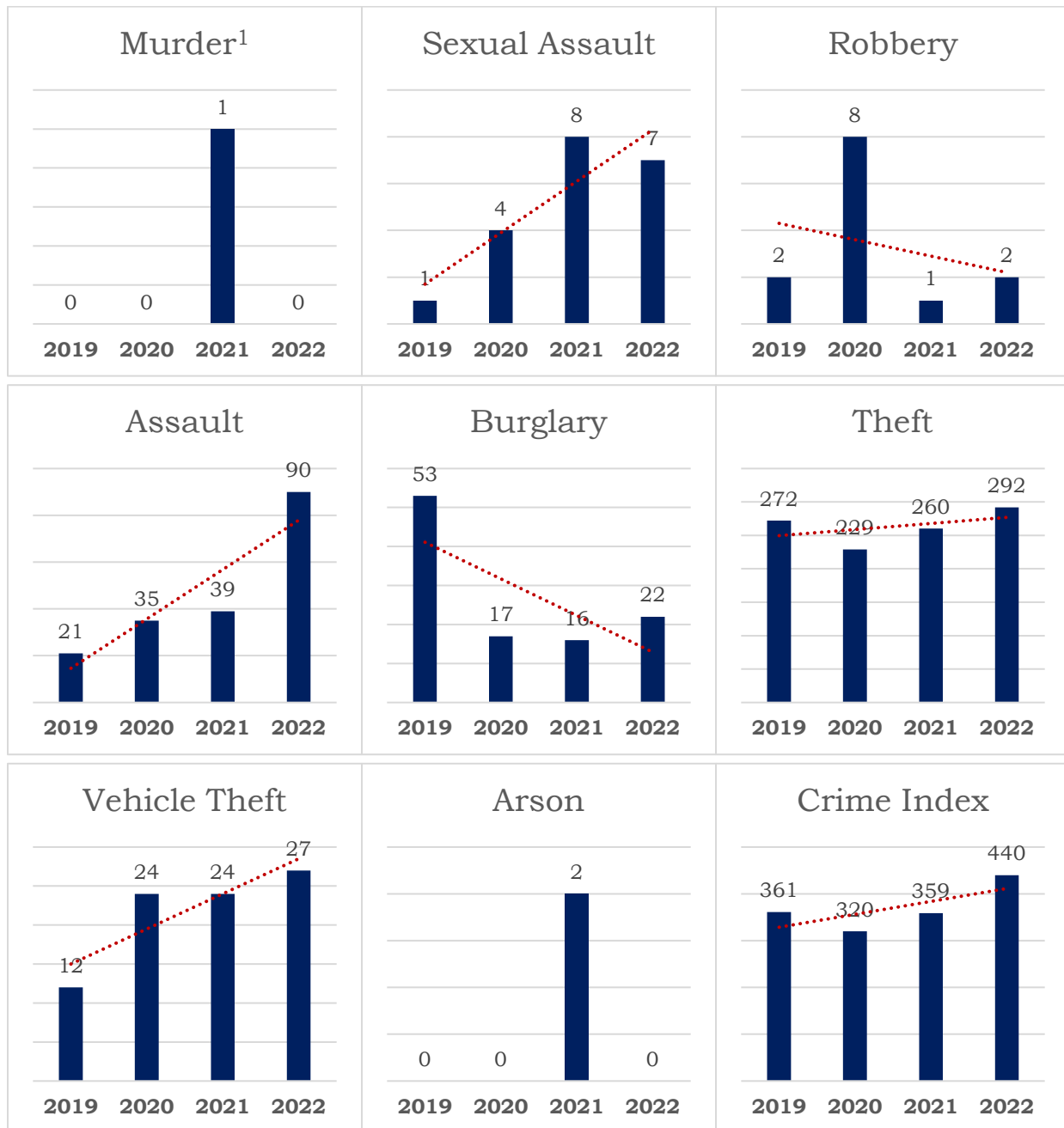
Figure 1 - 2021 Crime Data Summary

1) Intoxication manslaughter listed as murder, by rule